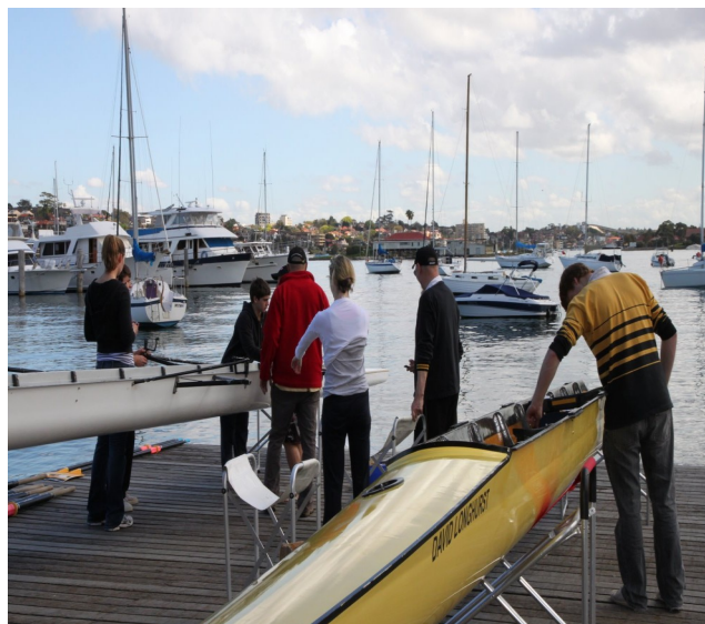
Photo shows : recent Working Bee (Learn to Fix) at Balmain Rowing Club