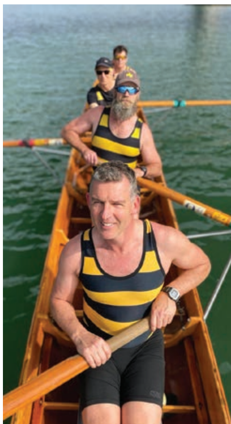
The return of timber boats on the Iron Cove were showcased in front of LRC in preparation for the 100th Anniversary of the JB Sharp series.