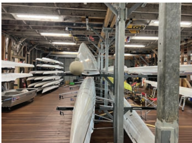
Consolidation of boat racks to make space for the new school