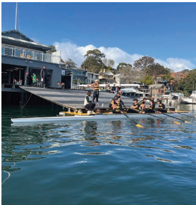
First regatta of the 2024 JB Sharp Series, hosted by Balmain Rowing Club