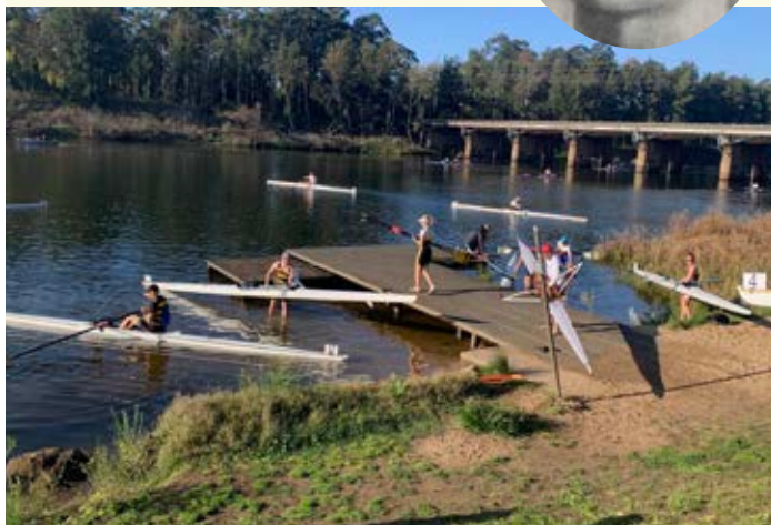
The start at North Richmond Bridge