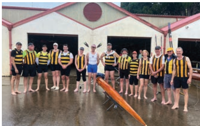
BRC members at the Wooden Boat Show hosted by Grafton Rowing Club, also established in 1882 with the same colours!