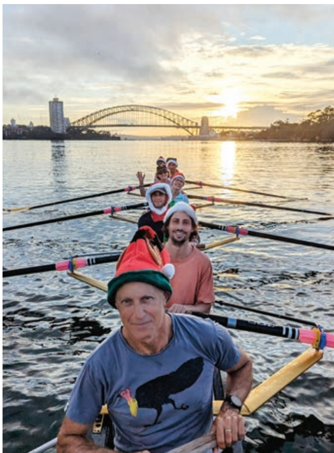
Perfect conditions for the annual Christmas morning row