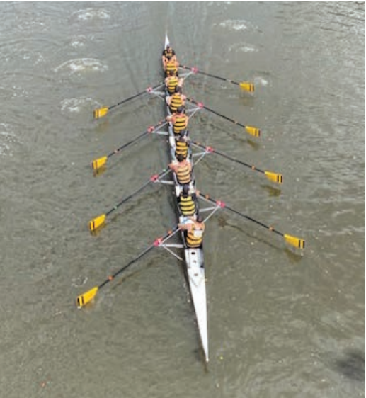
Mens Masters 8+ in full swing at Head of the Yarra