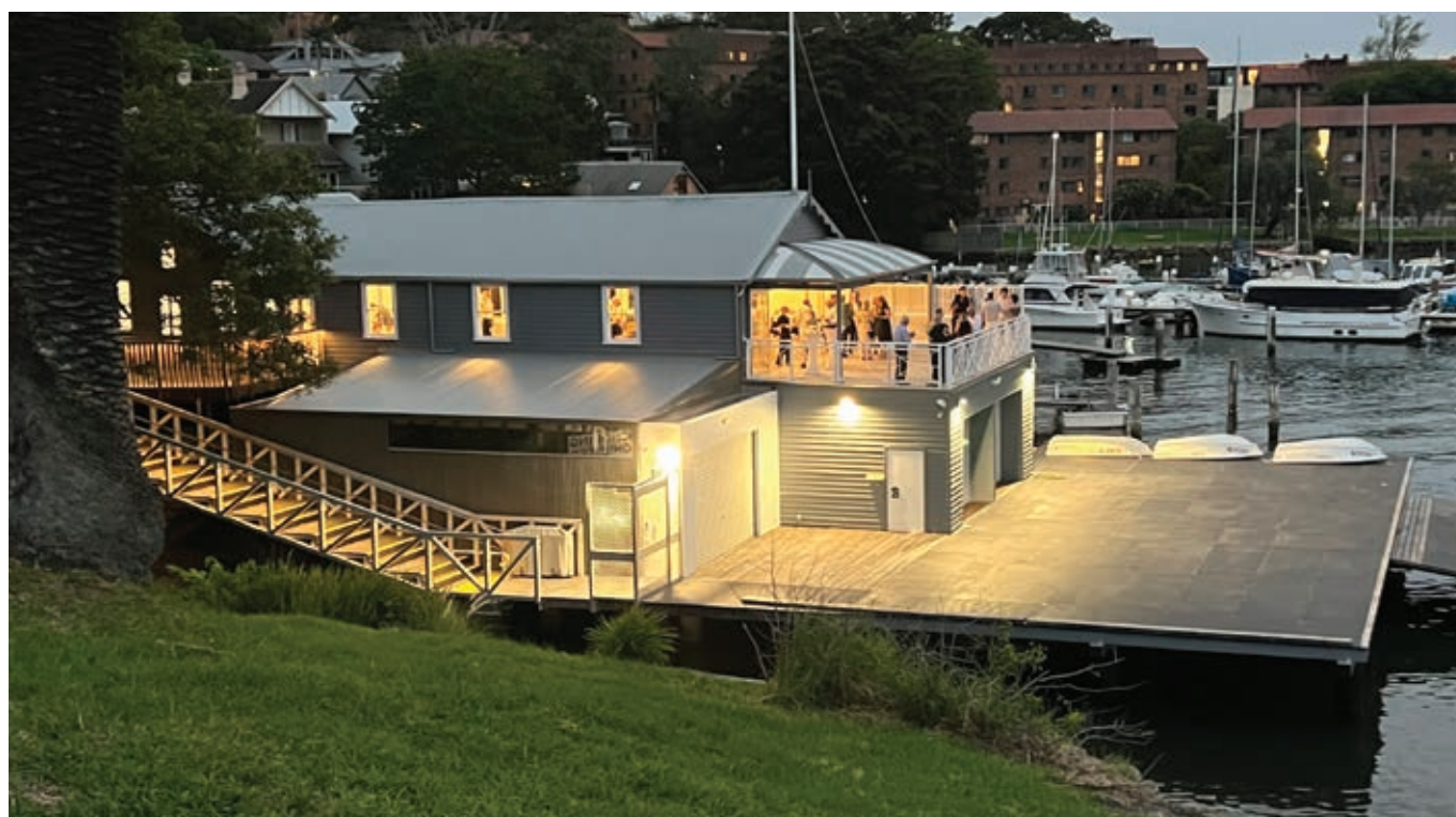
The restored boathouse is now a stunning venue for wedding receptions, corporate and community events, fundraisers, and private parties.